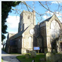
St. Mary & St. Eanswythe's Church