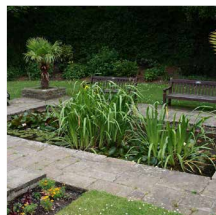
St. Eanswythe's Pond