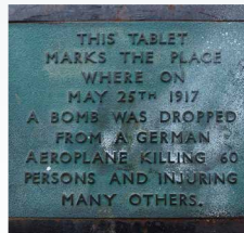
WWI bomb site