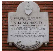
William Harvey plaque