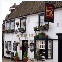
The British Red Lion